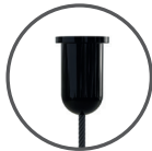
Top Hat (ED6)