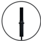
Stud (EF6, EF8)