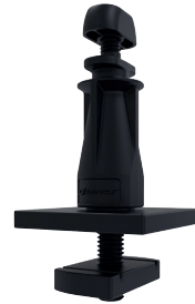
UniGrip – Central Exit No. 2 & No. 3