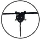
C-Clip (CC3, CC6)