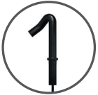
Cladding Hook (TH)