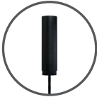
Barrel (ET6, ET8)