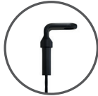
90° Eyelet (EO90)